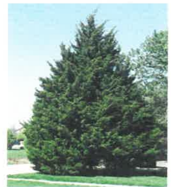
Eastern Red Cedar

Tree pruning, and removal of trees, is currently taking place at the Sports Complex. An Austrian Pine's diseased limbs are being removed, and 3 Austrian Pine's will require complete removal due to the disease. Also being removed is a small Ash that died due to the Emerald Ash Borer, and a Serviceberry that suffered extensive wind damage. Austrian Pines continue to be a problem, because as they age they become susceptible to a fungal disease, Diplodia Tip Blight. When the Austrian Pine was introduced to the market, they were sold as a good needled evergreen, and soil and drought tolerant for Ohio. As the trees have matured, the disease has caused a lot of issues. Disease control includes multiple applications, 2-3 times per year, of a fungicide in the Spring that may or may not help, and weather and timing are critical. Therefore, we have not planted an Austrian Pine in 25 years. New evergreen alternatives for our Parks are constantly being looked at. The Eastern Red Cedar has been deemed strong for the Ohio environment, and will most likely be used in the future.