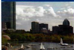
A Guided Tour of Boston

Day 7: Today after enjoying Continental Breakfast, you depart for home... a perfect time to chat with your friends about all the fun things you have done, the great sights you have seen, and where your next group trip will take you!