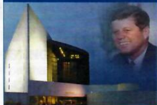
JFK Library & Museum