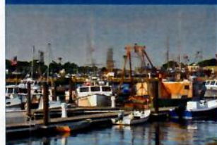
Historic Gloucester "America's Oldest Seaport"